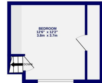
TOTAL FLOOR AREA: 757 sq.ft. (70.4 sq.m.) approx.

Whilst every attempt has been made to ensure the accuracy of the floorplan, measurements of rooms and any other items are approximate. If included in the plan the garage/stores will form part of the overall floor area and no responsibility is taken for any error, omission or mis-statement. This plan is for illustrative purposes only and should be used as such by any prospective purchaser. The services, systems and appliances shown have not been tested and no guarantee as to their operability. Made with Metropix ©2026